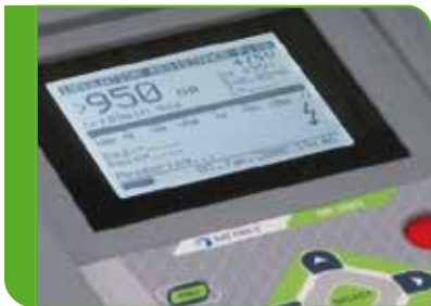
Real time resistance against time graph plotting facility