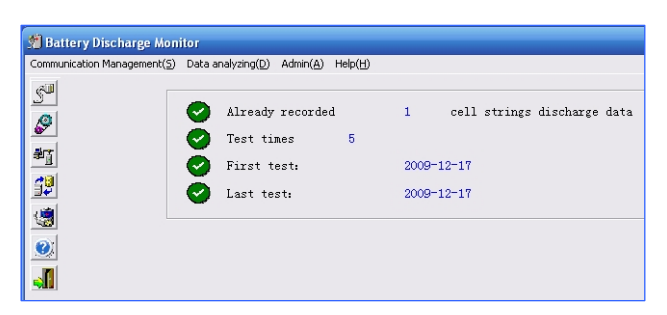
Simple interface with short-cut keys

All standard load units of PITE 3980 come with analyzing software. Real-time data monitoring (with DAC), testing data analyzing and report printing are all available with the PITE DataView software.