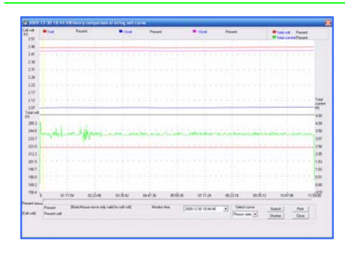
Discharging curves of each cells