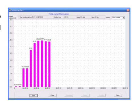
Histogram of difference cells